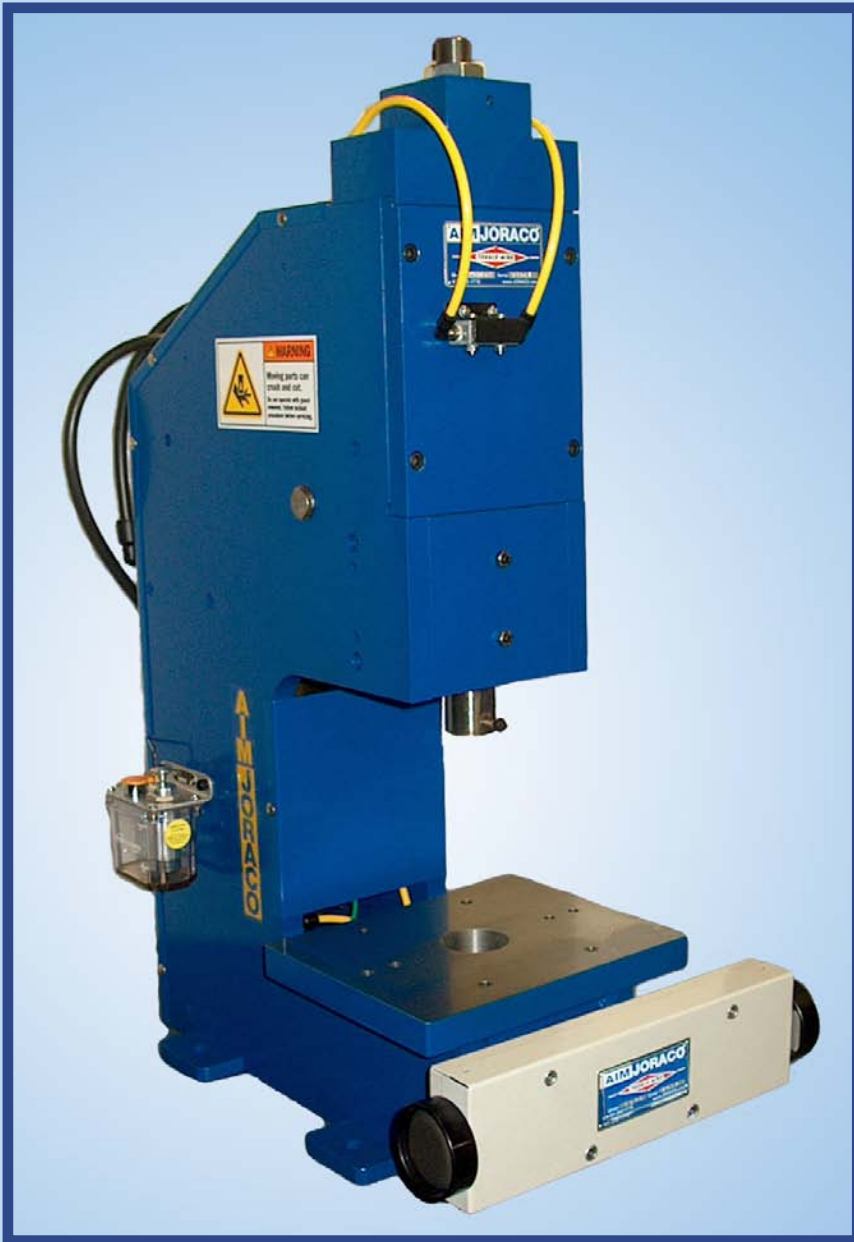
Press above shown with OPTIONAL Lube,